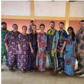
BENIN, WEST AFRICA TEAM