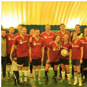
GCSPORTS SOCCER TEAM