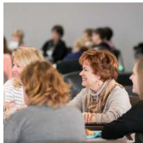
LADIES BIBLE STUDY