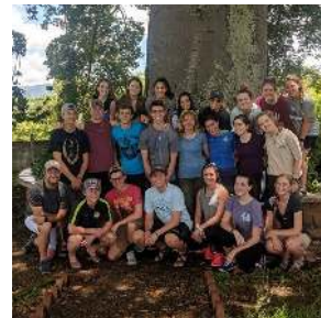
YOUTH GUATEMALA TEAM