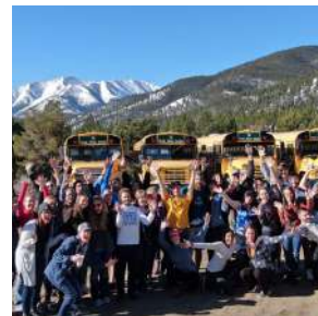
YOUNG ADULTS RETREAT