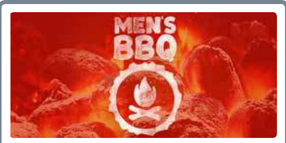
SEPT 13 · $15 ($25 AT THE DOOR) · 6-8:30 PM

Become a vital part of our family by leading, giving, and praying.